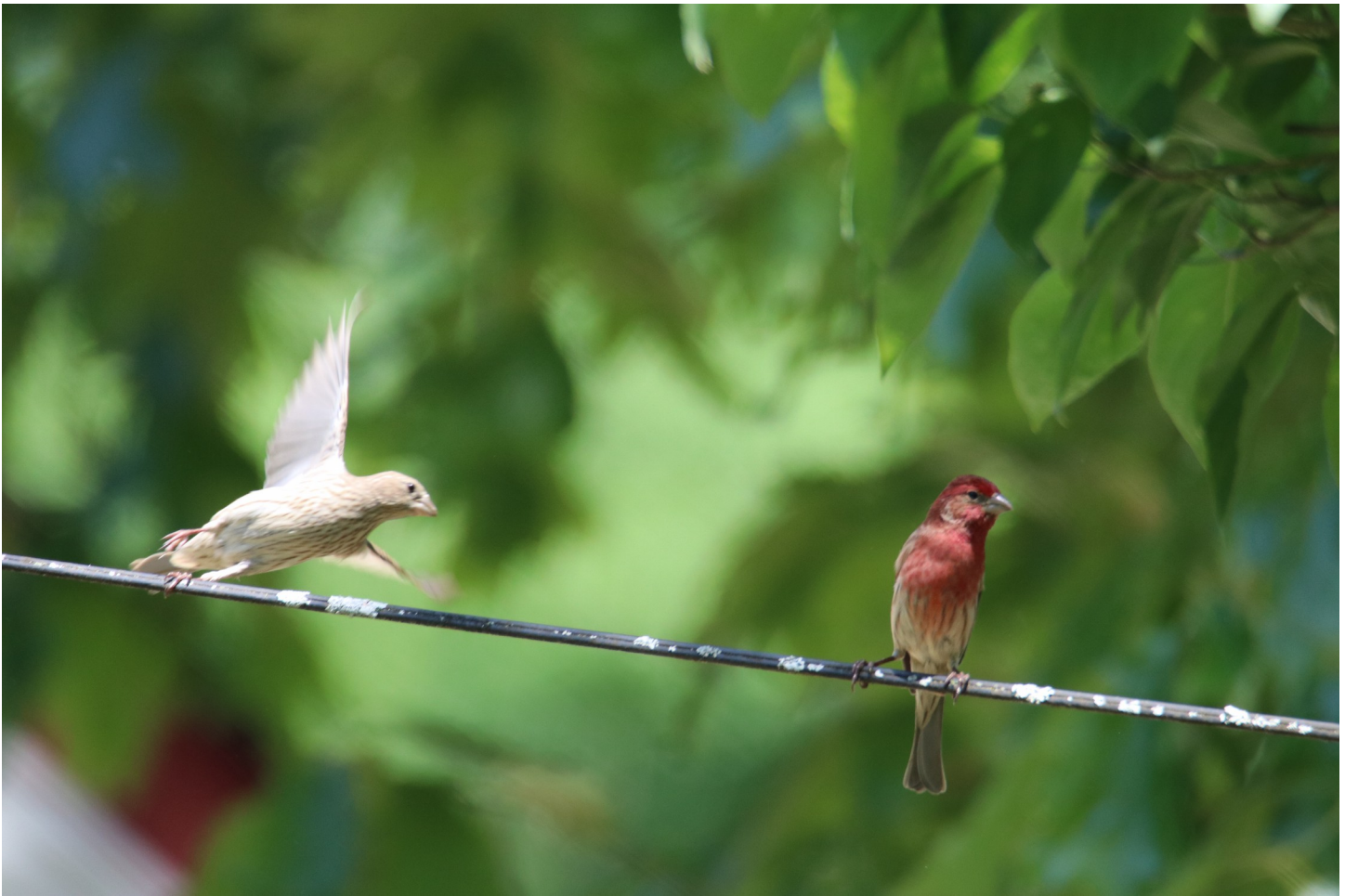
Do you feel like this House Finch? - "25 days of quarantine and I'm ready to kill my wife!"